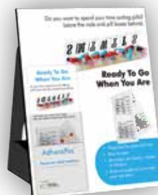
Tabletop Stand with Sign-Up Forms

Sorry, no substitutions within marketing kits.