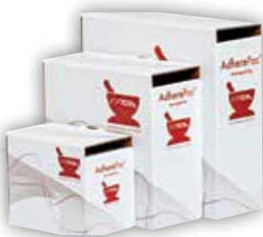
Customized AdherePac™ Reusable Boxes