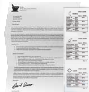
Target Market Letter and Samples