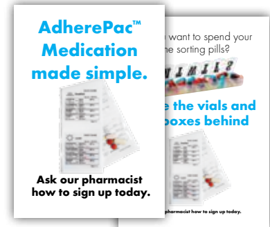
2-Sided Hanging Poster