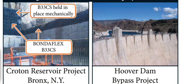
Croton Reservoir Project Bronx, N.Y.

Just two examples of how Monmouth's materials (Bondaflex B33CS & Durafoam C121A) helped guarantee the success of the project: