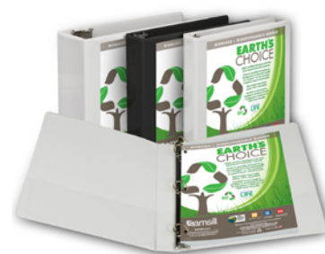
D-Ring View Binders