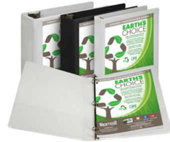
Round Ring View Binders