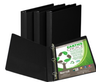
Round Ring Storage Binders