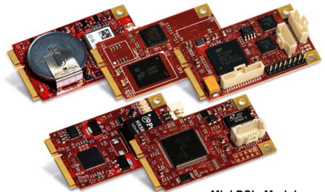
Mini PCIe Modules