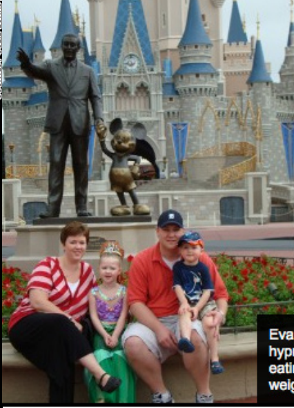
Evans began gastric bypass surgery hypnosis in late 2007, and began eating less the next day. By 2008, the weight was steadily coming off.