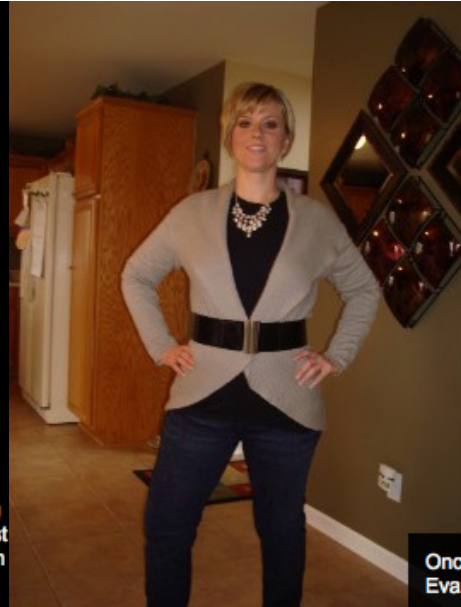
Once afraid to step into a gym, Evans now loves to exercise.