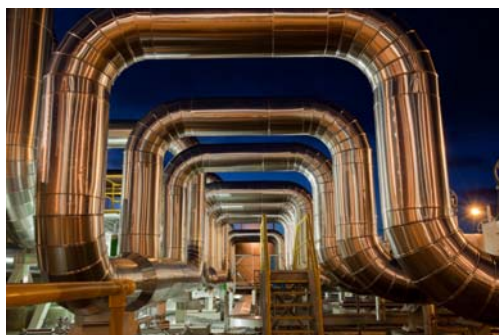
2012 – Expansion Pipe-Work by Alan Ofsoski