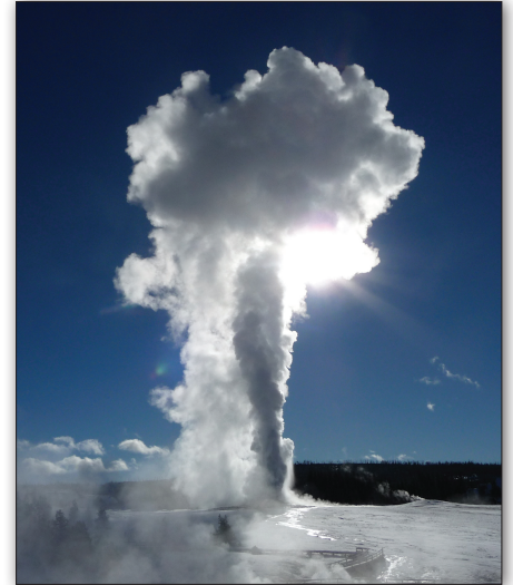
"Cold Faithful" by Greg Rhodes, Reno, Nevada, USA. Honorable Mention in the 2015 GRC Photo Contest.

Either black & white or color photos taken by the entrant are acceptable. The photos must be submitted in a digital jpeg format. Photos taken with a digital camera are acceptable. Photos taken with a film camera can be converted to digital and put on a CD at stores that have a photo processing department. Entries should be emailed to grc@geothermal.org with "Photo Contest" in the subject line, or mailed as a CD (preferred) to GRC Photo Contest. If you submit your photos by email, please make sure the total files are under 10MB. The winning entries will be displayed in PowerPoint format before the Opening Session and posted during the GRC Annual Meeting.