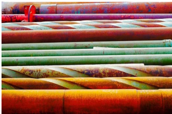
2015 – Drill Casings for New Geothermal Well