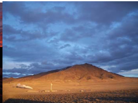
2009 – Blue Mountain by Ryan Nelson