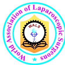
World Association of Laparoscopic Surgeons