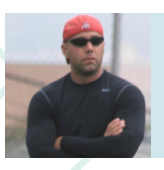
ROBERT CAPELLI Channel H The modern way to collect, query, and share healthcare data