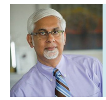
VINIT NIJHAWAN Entrepreneur, Venture Capitalist, Academic