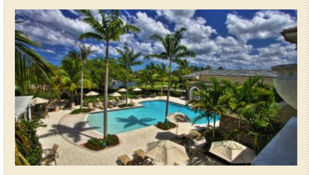
* Full story on Delaire Country Club on page 86