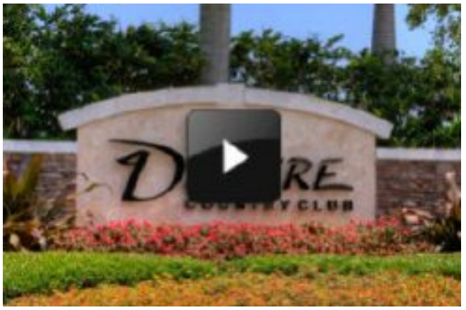
Click Here for a Video Introduction to Delaire Country Club