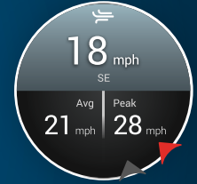
Wind Speed / Direction