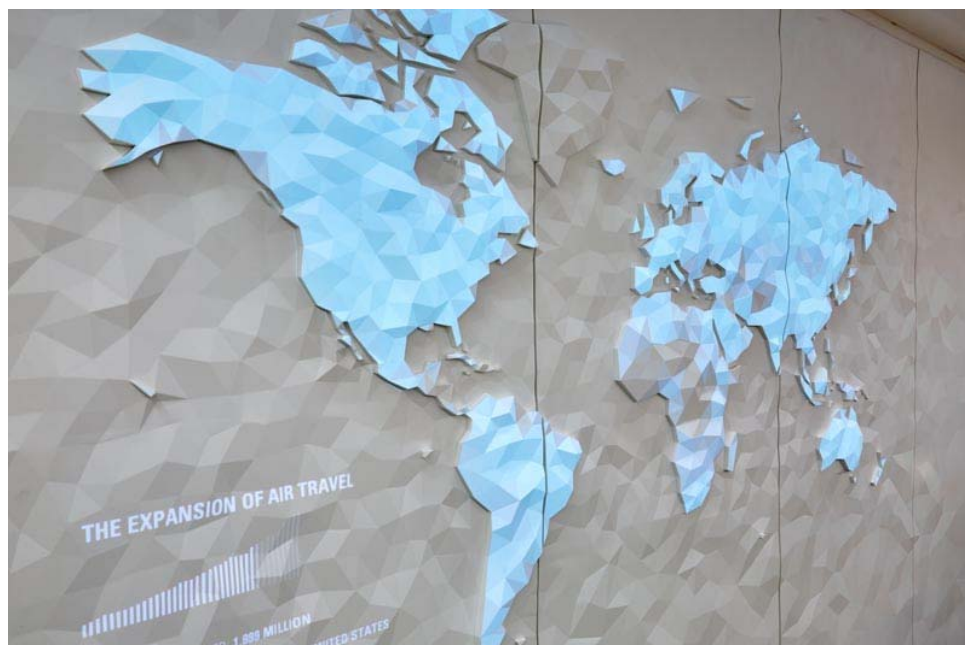
The award-nominated Living Atlas in Corian® by The Agency of Design, fabricated by Cutting Edge.

Please visit Corian® at Stand 210, The Surface Design Show, Business Design Centre, London N1 0QH, February 7 th – 9 th .