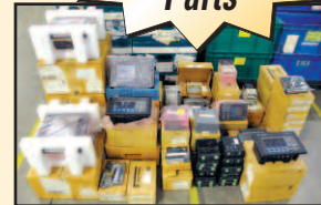
New Allen Bradley Panel View