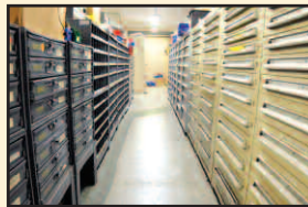
Lista Cabinets Full of Tooling