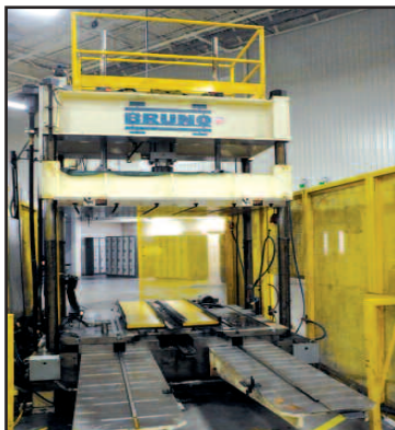
Bruno Hydraulic Press