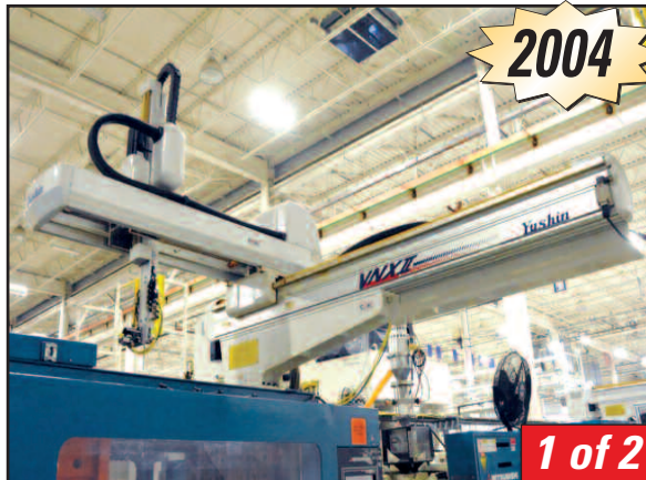
Yushin VNXII-250SL-11 Robot