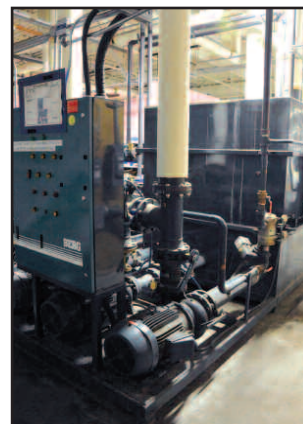
Berg Chiller and Tank