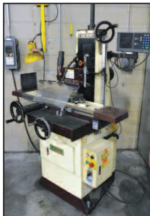
Chevalier FSG-618M Surface Grinder