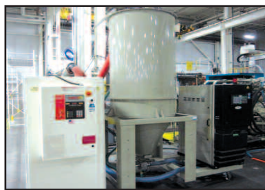
Conair and Thoreson McCosh Dryers