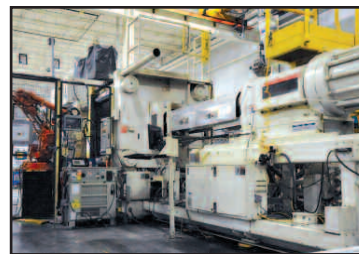
1000 Ton 165 Oz. Van Dorn Injection Molder

ALL SALES FINAL - NO EXCEPTIONS • Printed in USA. IL License #444.000215