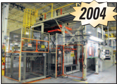
Kiefel Technologies KS96/200ST Thermoformer