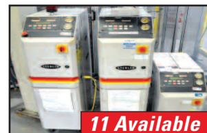
Sterlco Mold Temp. Controllers