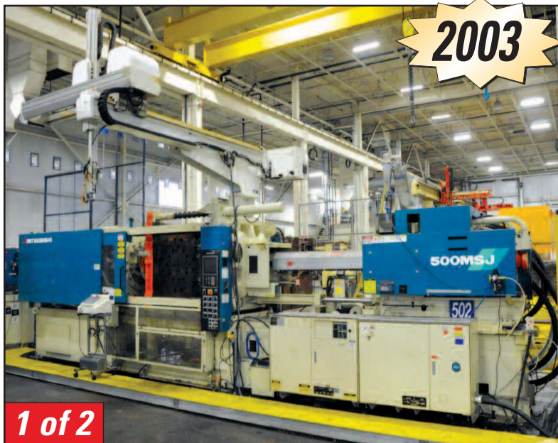
496 US Ton 52.2 Oz. Mitsubishi 500MSJ-60 Injection Molder