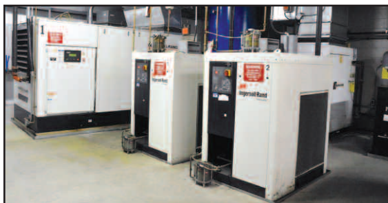
Ingersoll-Rand Air Compressors