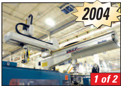
Yushin VNXII-250SL-11 Robot