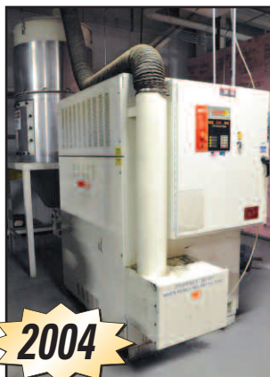
Thoreson McCosh TD-400 Dryer