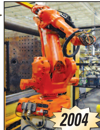
ABB IRB2400M2000 Robot