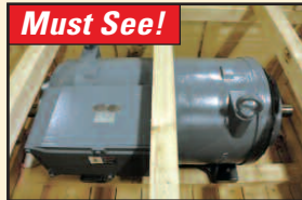
New Husky 400 Hp Motor