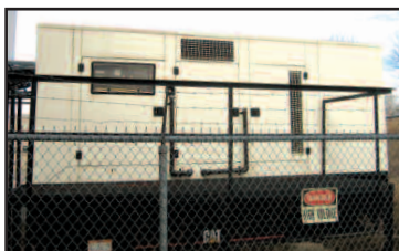
CAT Mdl. 3456 Generator Set