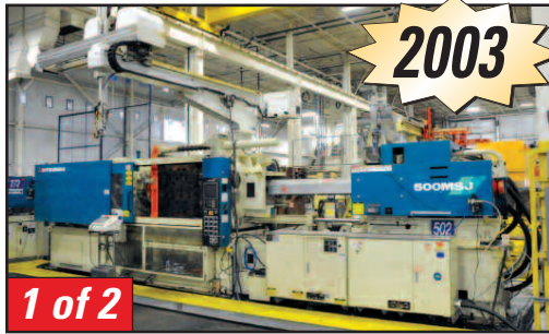
1 of 2 496 US Ton 52.2 Oz. Mitsubishi 500MSJ-60 Injection Molder