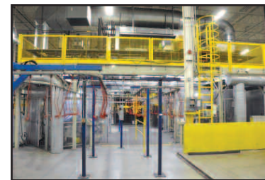
Krauss Maffei Foaming, Mixing & Metering Line