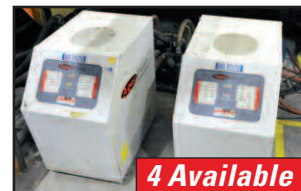
Aquatherm Mold Temp. Controllers

PLEASE VISIT OUR WEBSITE FOR MORE DETAILED LISTINGS