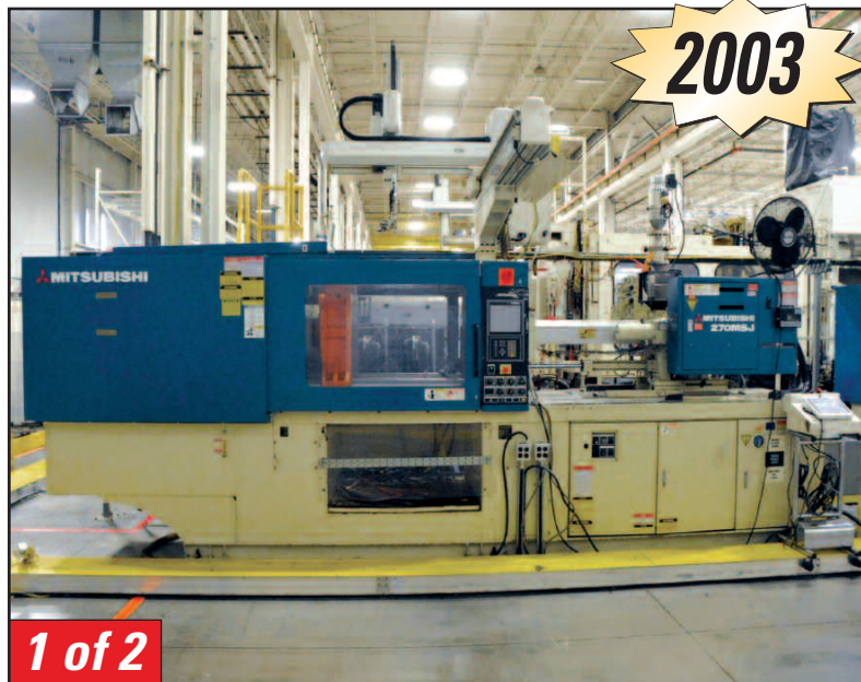
264 US Ton 16.3 Oz. Mitsubishi 270MSJ-17 Injection Molder