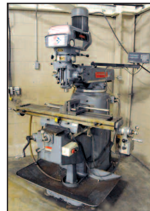
Clausing Kondia Mill Type FV-1