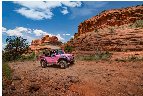
Schnebly Hill Road, Sedona

Sedona, AZ (Mar. 15, 2017) — Already a shining example of combining adventure and luxury into their incredible tours of the American Southwest, Pink Jeep Tours has also become an example—to their peers, their clients, and their communities—of conservation and environmentalism. While their passion for the great outdoors comes through in their tours of Las Vegas, Sedona, and the Grand Canyon, this passion is extended and further demonstrated through volunteer efforts, vehicle design, and so much more.