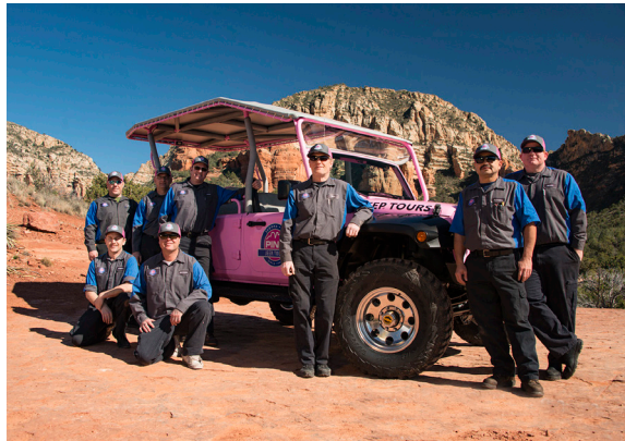
Pink Jeep Tours Shop Team