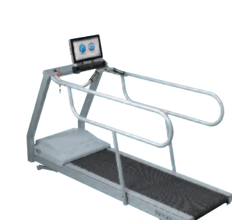
950-406 Includes Geriatric/Pediatric Handrails*

*All photos shown with Music Therapy option