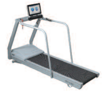
950-402 Includes Extended Handrails*

*All photos shown with Music Therapy option