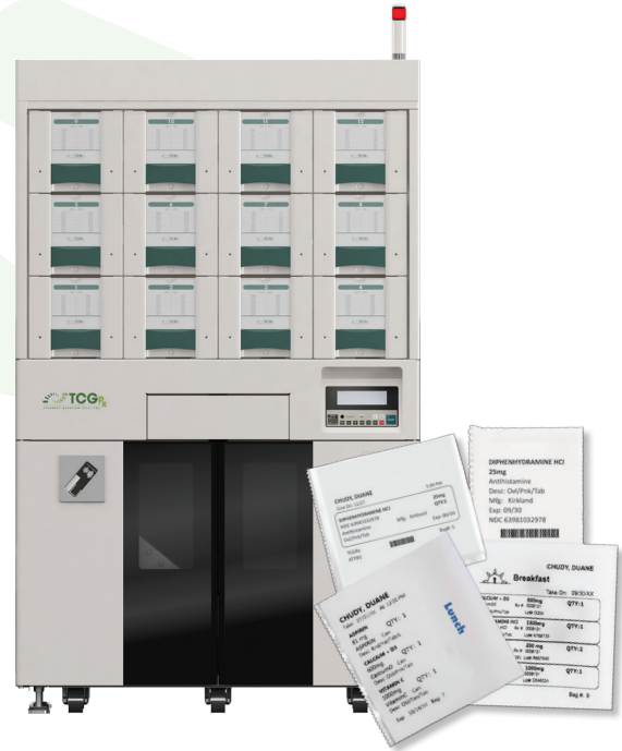
Small footprint provides advanced packaging technology for Adherence and Unit Dose Packaging