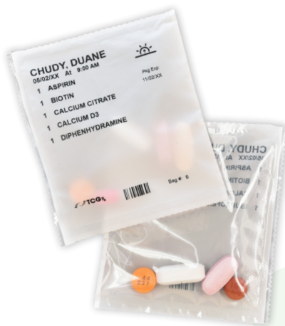
Adherence Packaging and Box Summary Label