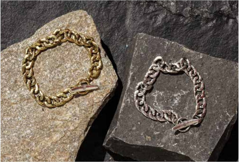
BOAT CLEAT CHAIN BRACELET - SMALL. Brass & Sterling Silver. CLEAT7MS-CHN-S. 7-1/2" $128.00