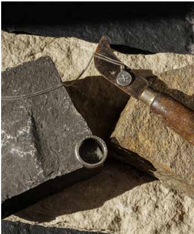
PEACEBRINGER NECKLACE. Sterling Silver. PCE5SS-22. 22" $75.00