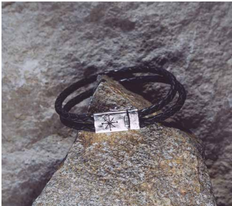
TWO STRAND LEATHER BRACELET – LARGE. Sterling Silver & Leather. 2STRD7SS-LTH-L. 8-1/4" $143.00