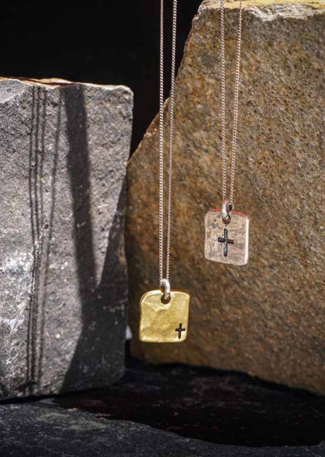
SMALL CROSS TAG NECKLACE. Sterling Silver & Brass. SCRSTG5MS-22. 22" $72.00 CROSS TAG NECKLACE. Sterling Silver. CRSTG5SS-22. 22" $88.00