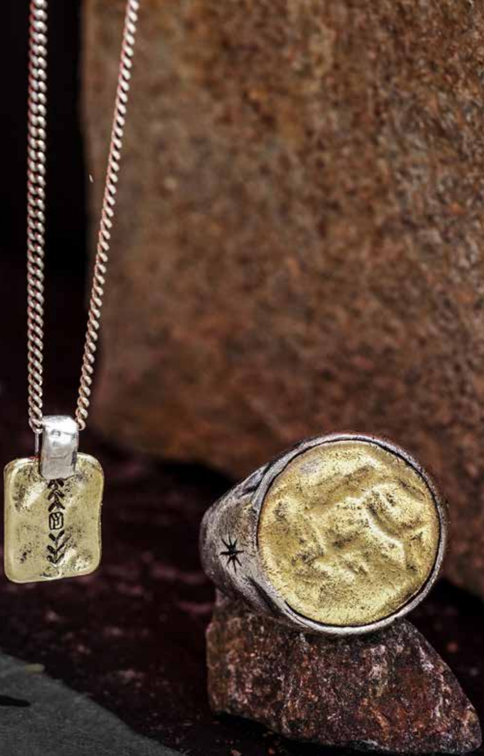
ARROW TAG NECKLACE. Sterling Silver & Brass. ARW5MS-24. 24" $98.00 SYMBOL SIGNET RING. Sterling Silver & Brass. Size 9-12. SYMB10MS-(SIZE). 25/32" $148.00