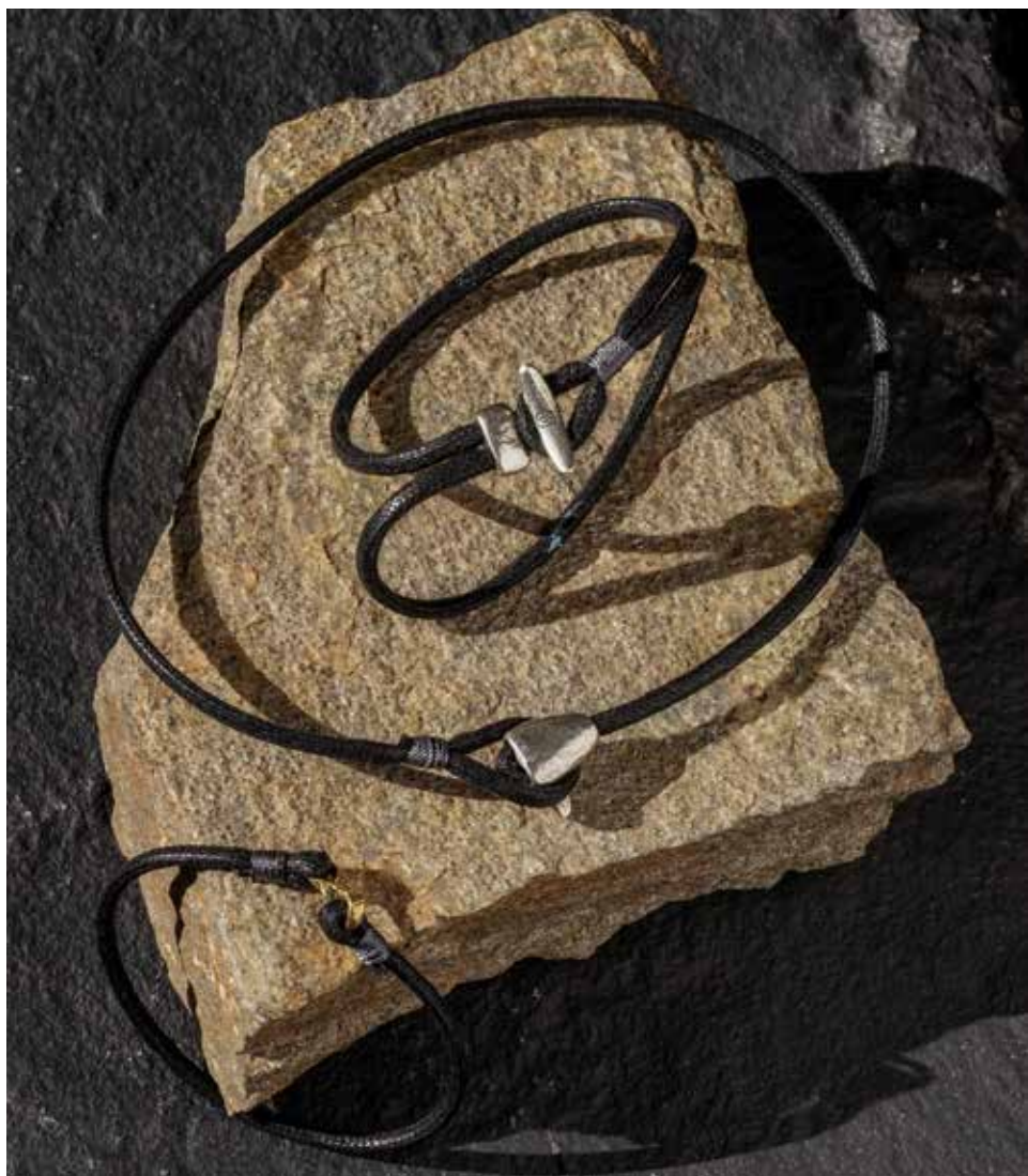
BOAT CLEAT WRAP BRACELET. Sterling Silver & Cotton Cording. CLEAT7SS-WRP. 15-1/2" $66.00 2 STRAND CLEAT BRACELET - LARGE. Sterling Silver & Cotton Cording. 2STRD7SS-CLT-L. 8-1/4" $66.00 SMALL HOOK BRACELET - LARGE. Brass & Cotton Cording. HOOK7BR-L. 8-1/4" $26.00