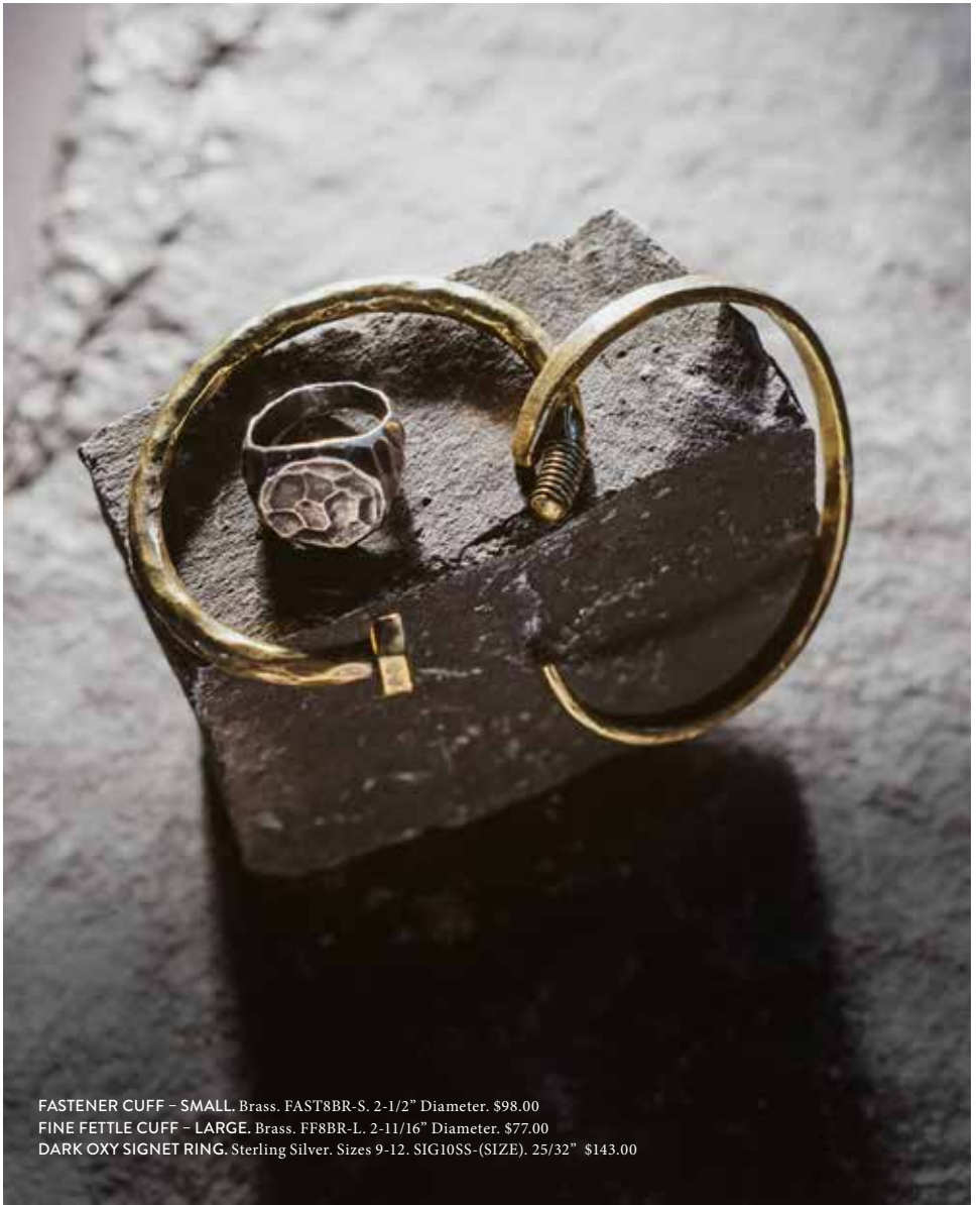
FASTENER CUFF - SMALL. Brass. FAST8BR-S. 2-1/2" Diameter. $98.00 FINE FETTLE CUFF - LARGE. Brass. FF8BR-L. 2-11/16" Diameter. $77.00 DARK OXY SIGNET RING. Sterling Silver. Sizes 9-12. SIG10SS-(SIZE). 25/32" $143.00