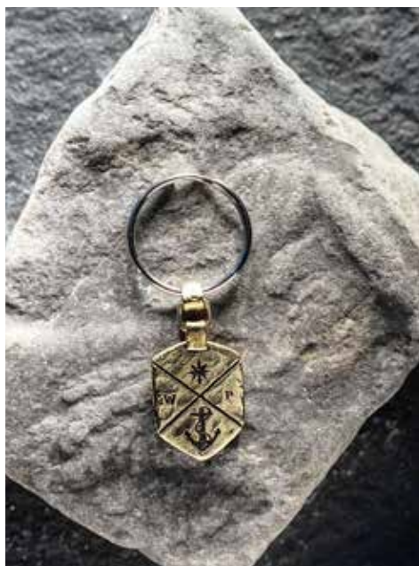
COMPASS KEY FOB. Sterling Silver. KF15-CMPS. 7/8" $75.00