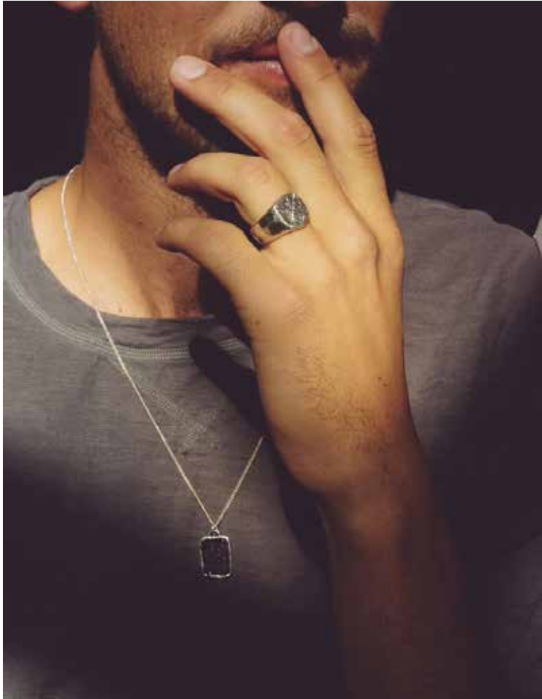
COAT OF ARMS RING. Sterling Silver. Sizes 9-12. COA10SS-(SIZE). 19/32" $125.00 NIGHTROVE NECKLACE. Sterling Silver & Swarovski Crystals. NGHT5SS-26. 26" $130.00