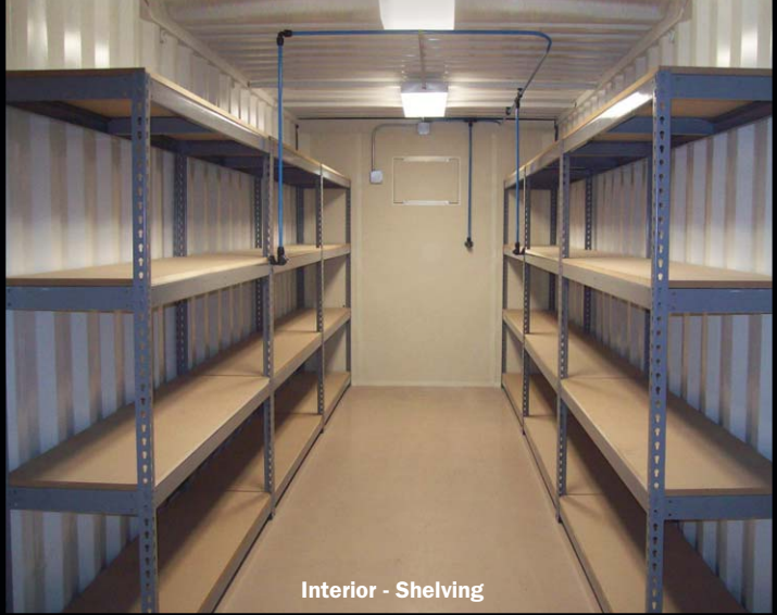
Interior - Shelving