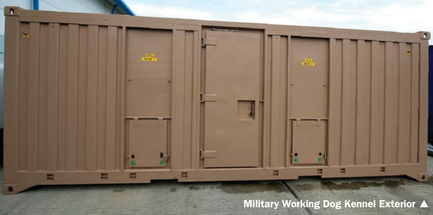
Military Working Dog Kennel Exterior ▲