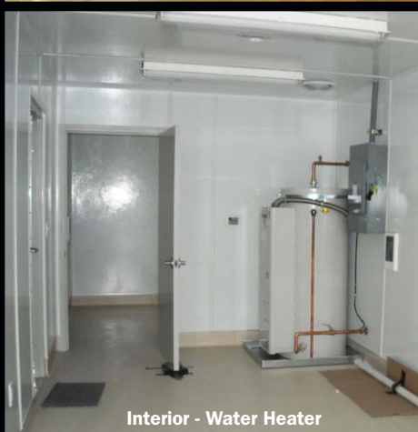
Interior - Water Heater