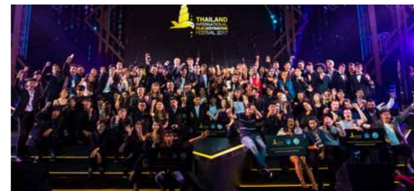
Participants in the Thailand Short Film Competition 2017

Surely the most rewarding, exciting and challenging short film competition in the world!