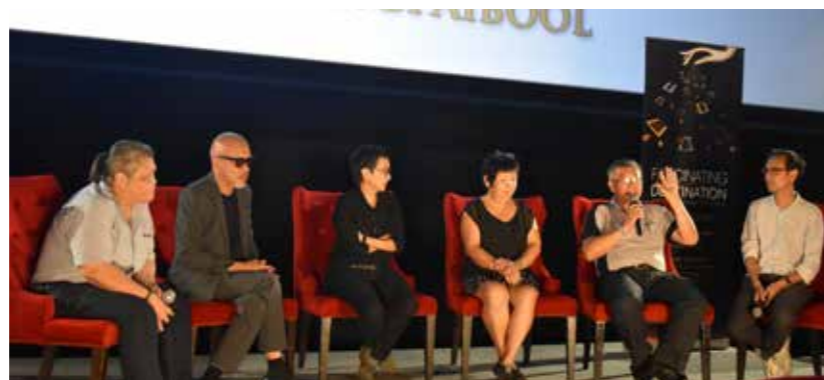
‘The Killing Fields’ Team Reunion