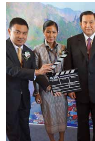
(L to R) Mr. Pongpanu Svetarundra - Permanent Secretary of Ministry of Tourism and Sports, Ms. Kobkarn Wattanavrangkul - Minister of Tourism and Sports, General Tanasak Patimapragorn - Deputy Prime Minister

The full details of the incentive measures are available from the Thailand Film Office.