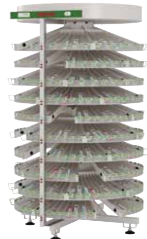
Beacon ® Carousel