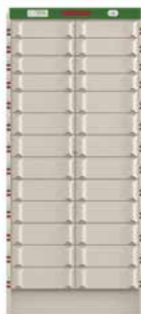
Beacon ® Shelving