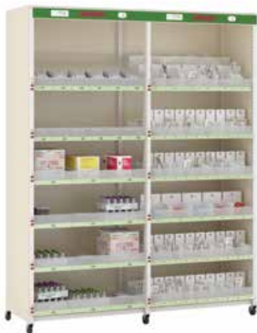
Beacon ® High Density Storage Drawers