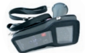
Holster Ref. LKSCOVER