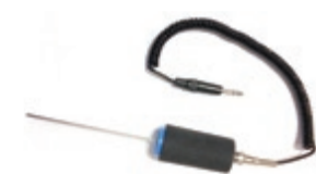
Mechanical US sensor (steam trap - bearing) Ref. LKSPROBE