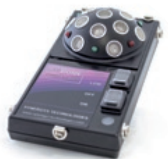
Ultrasonic emitter Ref. LKSDOME