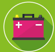
Batteries & Accessories