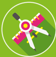
Design & Build