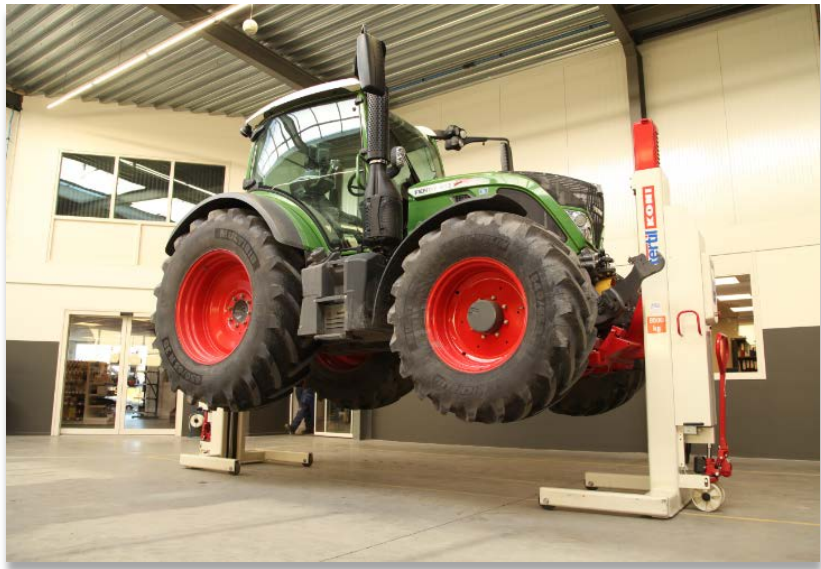
The multi-purpose adapter attaches to the mobile column lift forks allowing the vehicle to be lifted by its frame rather than its wheels

The significance to maintenance facilities that use Stertil-Koni mobile columns has been described as "transformational." Why? The majority of vehicle maintenance and repair is focused near the wheels – such as tires, brakes, steering and suspension work – making it important that the wheels remain accessible during maintenance and servicing.