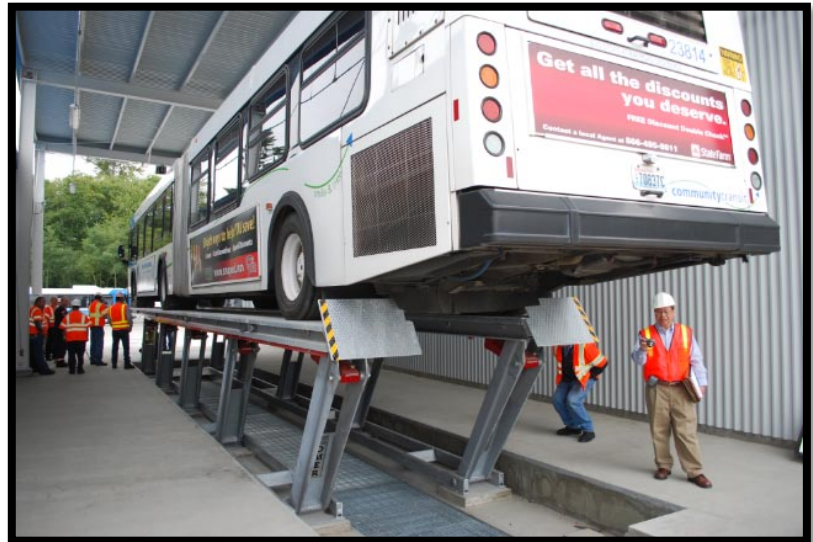
When undercarriages are not cleaned frequently, the lifespan of a vehicle's engine and battery system can be cut short. The special hot dip steel coating on the platform SKYLIFT Wash Bay model is corrosion- and water-resistant

Here's what's fueling the change: "When road grime accumulates on the undercarriage of work trucks, buses and new hybrid/electric vehicles, heat builds up and can decrease engine efficiency. That in turn necessitates more frequent washings to keep battery and engine systems cool and free from mud, salt and other contaminants," noted Peter Bowers, Stertil-Koni technical sales support manager.