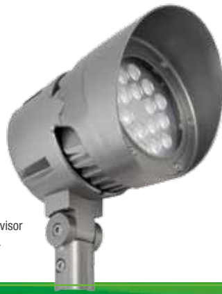
FCF1106 Shown with visor optical accessory.