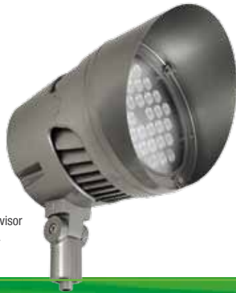
FCF1109 Shown with visor optical accessory.