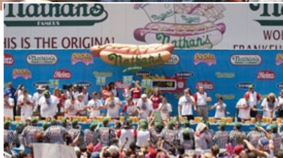
Nathan's Famous Hot Dog Eating Contest Join us for DC's annual Nathan's Famous Hot Dog Eating Contest at the BBQ Battle. Join us Saturday, June 23rd on the Monster Energy Stage.