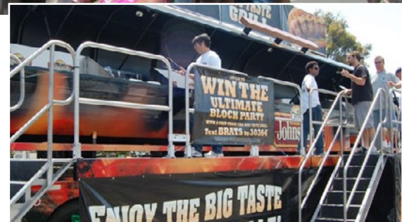
Johnsonville Big Taste Grill Featuring mouth-watering brats with portions of donation to USO-Metro. Stop by and see what's cooking at the Johnsonville Big Taste Grill.