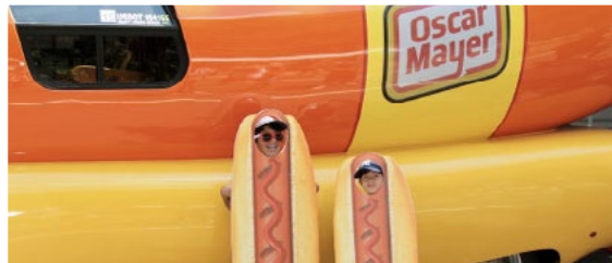
Oscar Mayer WienerMobile Oscar Mayer's Hotdoggers have set out on a mission across the country in the WienerMobile. And they're taking the new 'dogs with them. Stop by and visit us during this year's exciting event.