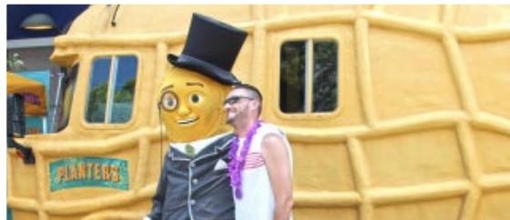
Planters NUTmobile The NUTmobile has hit the road for a year long adventure and will be making a special stop at this year's BBQ Battle.