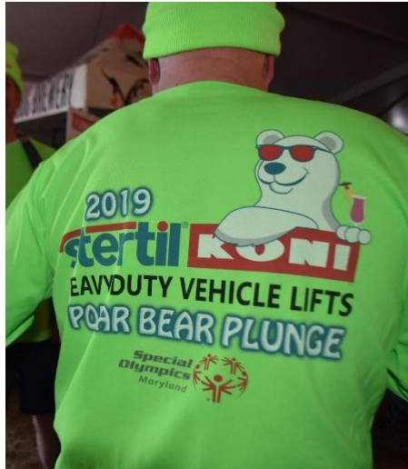
Stertil-Koni specially designed fluorescent green long-sleeve shirt logo