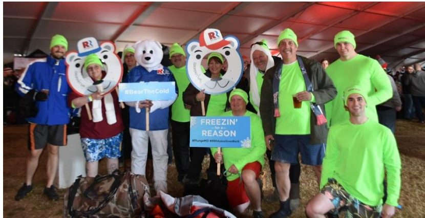
Team Stertil-Koni poses with the Maryland State Police Polar Bear Plunge mascot Beary White pre-plunge

STEVENSVILLE, MD February 6, 2019 – Heavy duty vehicle lift leader Stertil-Koni went to a very cold place recently – all for a good cause – to warm some very important hearts, those of the Special Olympics Maryland.