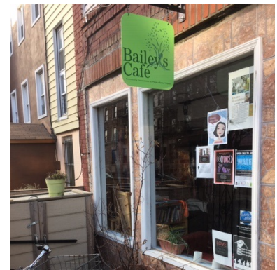
Bailey's Cafe storefront in Brooklyn, NY