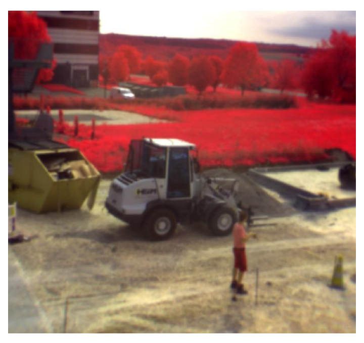
True resolution hyperspectral snapshot image, taken with the ULTRIS 20 out of the window (CIR)