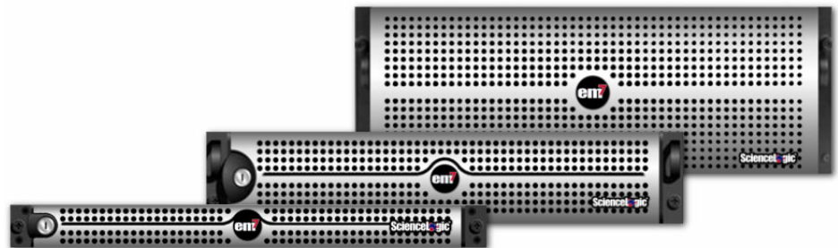
Models include: E1500, E2500, E4500

EM7 easily scales for enterprises of all sizes. The EM7 solution comes in a variety of configurations - depending on the number of devices to be monitored and how your network is deployed. The solution is easily scalable for monitoring from 25 to thousands of networked devices and tens of thousands of interfaces.