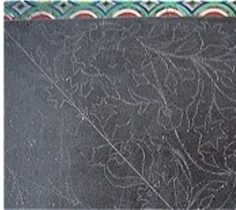
A design layout on the Marble Stone

Grooves, measuring 3-4 mm, are made at the appropriate places on the marble surface and, at the same time, the work of refining the stones is carried out. The grooves are made exactly of the same size so that the stones can fit perfectly in them. During this process special emphasis is laid on choosing various shades of semiprecious stones to give the right gradation and shading to the flowers and other motifs.