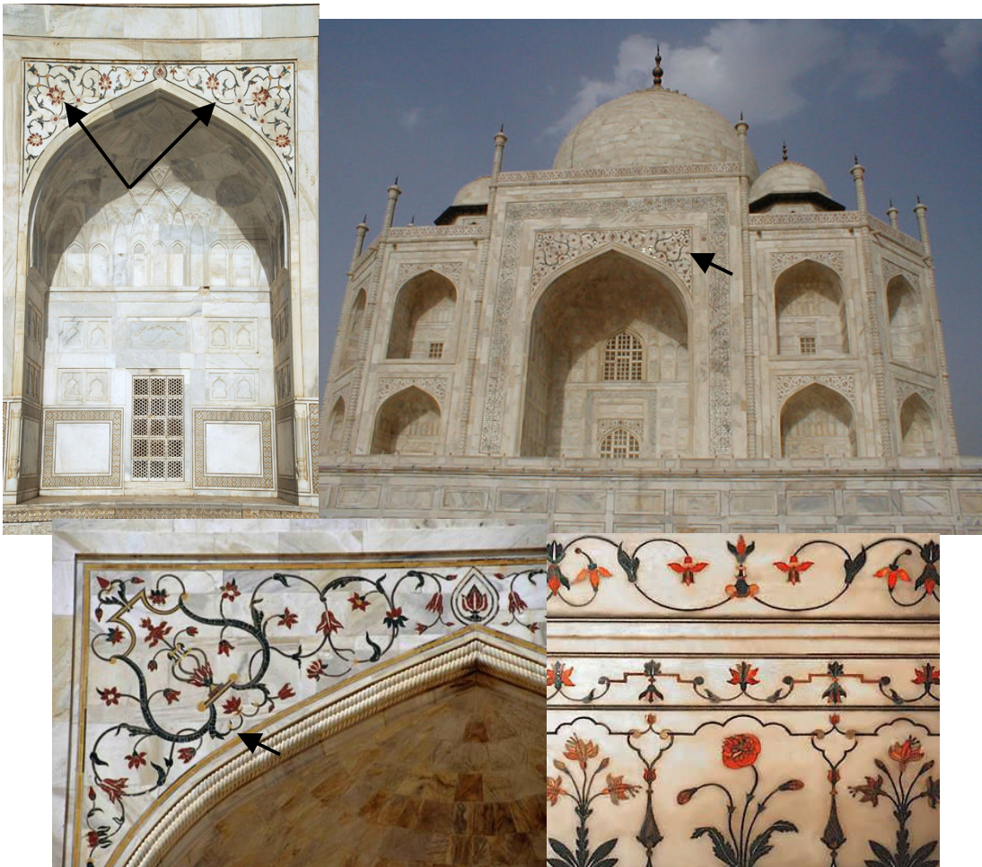
Marble Inlay (Pietra Dura) Craftsmanship in the Taj Mahal

The art of inlay work (also called pietra dura ) played an important role in not only shaping but also in enlivening the structures erected by the Mughals in India. This is evident in its most dominant form in the incomparable Taj Mahal . The crown of Mughal architectural activity, the Taj Mahal, constructed between 1630 and 1653 by a workforce of more than twenty thousand, is said to be one of the Seven Wonders of the World. One of the most beautiful specimens of mankind's cultural heritage, this monument of love was the vision of the fifth Mughal Emperor in India, Shah Jahan. His tribute to his beloved wife, Arjumand Bano Begum, popularly known as Mumtaz Mahal, has been embodied in the pure white marble structure of the Taj Mahal.