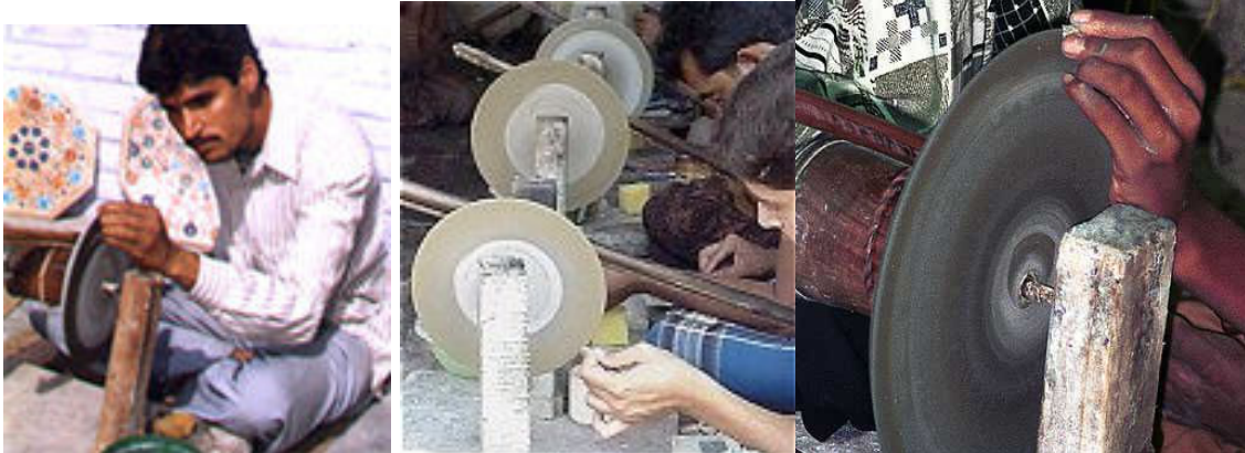
Precious Stones for Inlay being filed and shaped using Emery wheels

Emery stone wheel is used to file and refine these precious and semi-precious stones like Agate, Amethyst, Blue & Green Aventurine, Cornelian, Jasper, Lapis-Lazuli, Melachite, Moss-Agate, Sodalite, Tiger's Eye, Serpentine, Chalcedony,