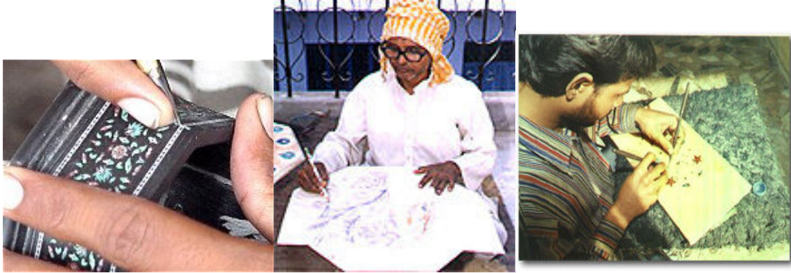
Precious Stones being inlaid on marble stone

inlaid in marble may be comprised of 50 or more stones. Each part of the design is shaped individually and requires a lot of patience and skill. At times a single Magnolia flower may have more than 100 individual pieces and may require about one week to make.