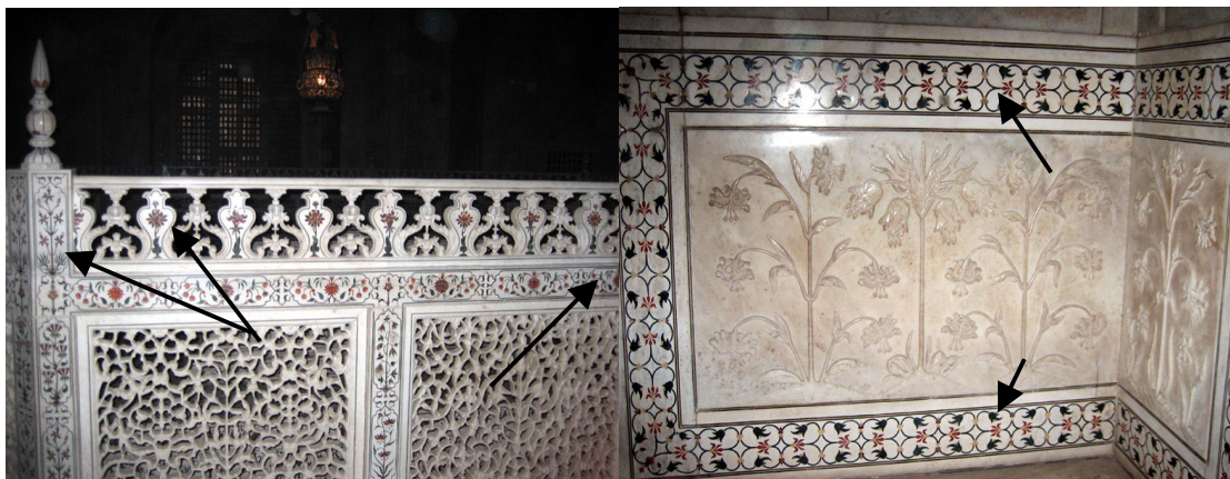
Pietra Dura Craftsmanship inside the Taj Mahal Mausoleum where the Mughal Emperor Shah Jahan and Queen Mumtaz Mahal have been buried

deceased wife's memory. The master craftsmen who specialized in this fine art of setting gems and semiprecious stones in marble came from Persia (today's Iran) to decorate the Taj Mahal.