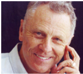
Morris Dees, Esq.

Morris Dees is the co-founder and chief trial counsel for the Southern Poverty Law Center in Montgomery, Alabama. The Center is internationally known for tracking hate groups and extremist activity, conducting tolerance training education and winning cases against white supremacists. Dees is a 1960 graduate of The University of Alabama School of Law. Dees frequently speaks to universities and legal associations. His autobiography, A Season For Justice (1991) was re-released in 2001 by the American Bar Association as A Lawyer's Journey: The Morris Dees Story . He also wrote Hate on Trial: The Case Against America's Most Dangerous Neo-Nazi (1993) and Gathering Storm: America's Militia Threat (1996).