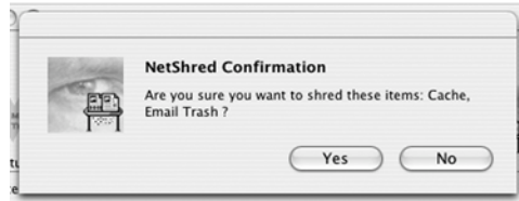
Figure 2: NetShred X Confirmation Dialog