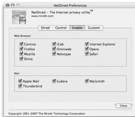
Figure 5: Preferences Enable Tab

Often, customers will enable only a single browser, for example Firefox, and then always use that browser for private browsing. By using Netshred with 2 browsers you can keep history and cookies for your typical browsing and shred them for your private browsing.