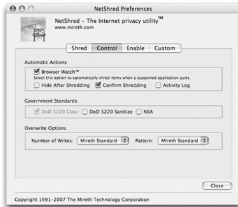
Figure 4: Preferences for running NetShred X automatically