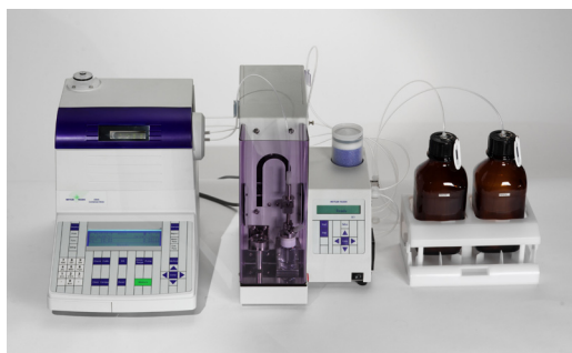
SC1 Sample Delivery and Cleaning Unit

The four standard substances, certified for both density value and refractive index can be used to certify or verify density and refractive index instruments or combined measurement systems. Certification or verification is often required by quality management standards such as GMP (Good Manufacturing Practice) or ISO 17025.