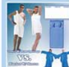
WEARABLE BLANKET VS. WEARABLE TOWEL