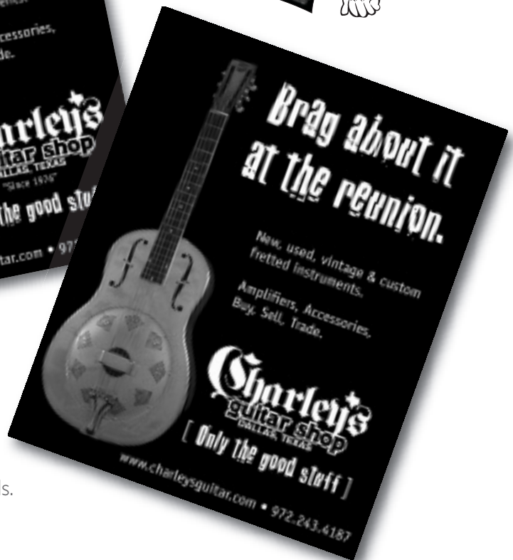
Charley's Guitar Shop "Only the Good Stuff" Retail Ads.