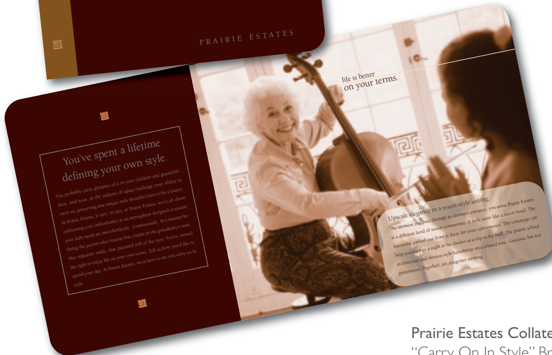
Prairie Estates Collateral "Carry On In Style" Brochure.