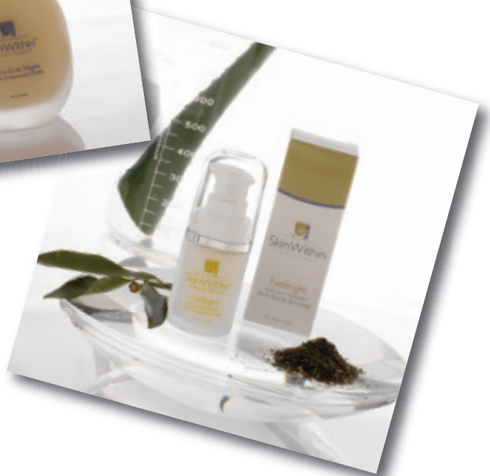
“SkinWithin” Package Design Scientific Skincare.