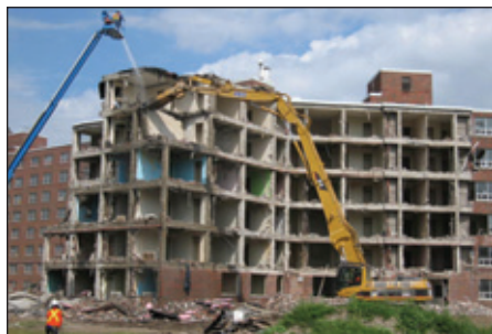
Toronto Revitalization Regent Park Demolition and Abatement, 2006: Demolition Project, Asbestos, Mould, PCB's and Soil Remediation.

Our experience includes extensive work on some of the largest, complex and scrutinized projects in Canada. Our breadth of experience in construction, demolition and environmental remediation including hazardous materials abatement and disaster recovery field is unmatched. REC encompasses virtually every type of facility and project in the municipal, institutional, commercial and industrial sectors.