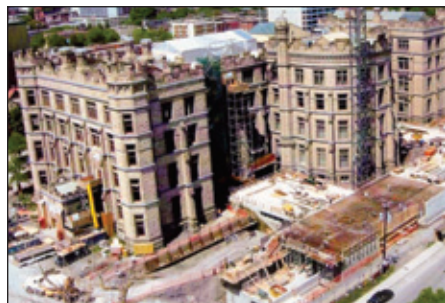
Museum of Nature Ottawa, 2004-2008: Demolition and Abatement Project, Historic Building Site

On every project we work with our clients to develop an effective stakeholder consultation process critical for successful project delivery. This is achieved through the establishment of open and clear lines of communication that both meet our clients' expectations as well as conforming with their existing reporting structures.