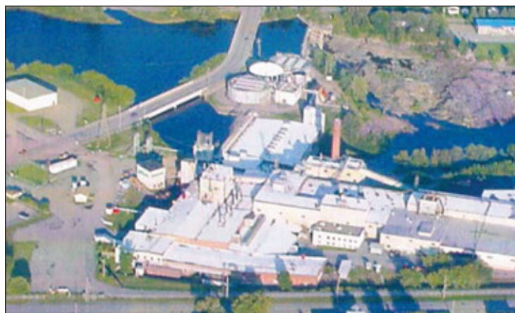
The Weyerhaeuser Pulp & Paper Mill, Sturgeon Falls ON: Extensive Asbestos Abatement, Hazardous Materials Removal, Soil Remediation and Demolition of a 300,000 square foot facility.

We have successfully completed over 8,000 projects including the removal of all Hazardous Materials, especially Mold/ Mould, Lead and Asbestos some by U.S. EPA – OSHA approved standards and regulations than any other company in Canada. Removal of all Hazardous Materials, Asbestos, Lead Paint, Lead Dust, Heavy Metals, Aluminum, Chromium, Cadmium, Perchloric Acid from Hoods, Infection Control in Health Facilities-SARS, PCB's, UFFI, Chemicals, Mold & Fungus, Micro-Biological Remediation, Pharmaceutical and Medical Manufacturing Plant Cleanups, Cleanup of Bag House and Dust Collectors, Soil Remediation, UST—Underground Storage Tanks. Environmental Cleaning and Decontamination of Industrial and Manufacturing Plants. All work completed by U.S.-EPA Standards following OSHA Guidelines for U.S. Corporations than any other company in Canada. Project Management in Occupied Facilities, Office Towers, Manufacturing and Plant cleanups are our specialty.