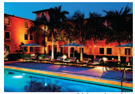
Fabulous outdoor pool area

With over 1,000 deluxe guest rooms in five unique styles, the exclusive Boca Raton Resort & Club is best described as a collection of five distinct boutique hotels situated on one expansive property. It includes the Cloister, the Yacht Club, the Tower, Boca Beach Club, the Boca Bungalows, Boca Country Club, conference facilities, two 18-hole championship golf courses, 30 tennis courts, Spa Palazzo, a golf clubhouse, six pools, a 32-slip marina with full fishing and boating facilities, and a half-mile of private beach.