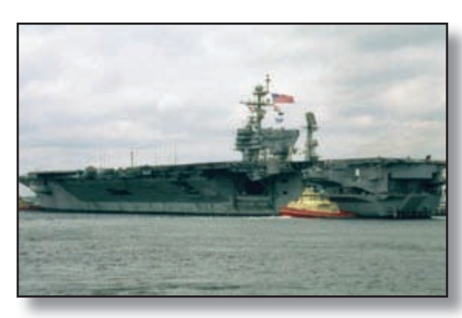
Donation to AFRT—$10,000

Members of Bands for Freedom Inc. traveled to Jacksonville, Florida, to greet the USS Kennedy—one of the Navy's most famous aircraft carriers—and welcome home many of our brave soldiers. During the visit, another $10,000 was donated to the Armed Forces Relief Trust.