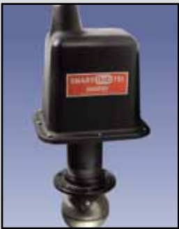
SmartBob-TS1 Cable-Based Sensor

Power Requirements: 115/230 VAC 50/60 Hz Ambient Temp: -40°F to +185°F (-40°C to +85°C) Process Temp: Up to 500°F (260°C) Measurement Range: Up to 180' Measurement Rate: 2 feet per second Accuracy: 0.1% Mounting: 3" - 8" NPT Enclosure: Molded polycarbonate Approvals & Certifications: Listed for Class II, Groups E, F, & G Hazardous Locations Enclosure Type: NEMA 4X, 5, 9 & 12