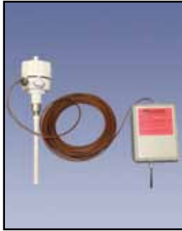
PRO REMOTE Capacitance Probe