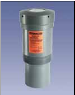
SmartSonic Ultrasonic Transmitter

Power Requirements: 115/230 VAC 50/60 Hz Ambient Temp: -20°F to +140°F (-29°C to +60°C) Process Temp: Up to 140°F (60°C) Measurement Range: 60 feet Measurement Rate: 1 foot per second Accuracy: 0.1% Mounting: Special bolt on or 3" - 6" NPT Enclosure: Rotational molded polyethylene Approvals & Certifications: NEMA 4X (IP65)