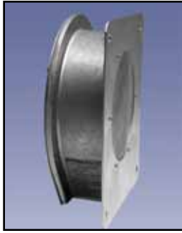
BM-45 Diaphragm Switch