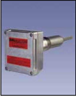
VR-21 Vibrating Rod