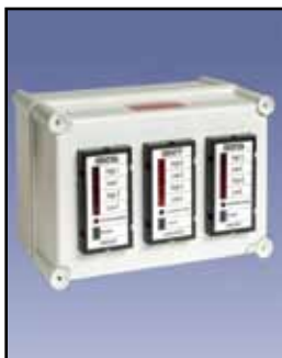
BM-12 Point Level Alarm Panel

Switch Ratings: 15 Amps @125 or 250, 1/8 HP @ 125 VAC, 1/4 HP @ 250 VAC, 1/2 Amp @ 125 VDC, 1/4 Amp @ 250 VDC Operating Temp: -40°F to +300°F (-40°C to +149°C) Approvals & Certifications: Listed for Class II, Groups E, F & G Hazardous Locations Enclosure Type: NEMA 4, 5, 9 & 12 Housing Enclosure: Die cast aluminum Mounting: Internal or external, 16 gauge galvanized mounting plate