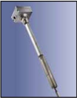
VR-41 Vibrating Rod

Power Requirements: Wide range 20-250V AC/DC Relay: SPDT relay, 5A @ 250 VAC (optional DPDT relay available) Time Delay: 1 second from stop of vibration, 2 to 5 seconds for start of vibration Ambient Temp: -4°F to +150°F (-20°C to +65°C) Process Temp: To 176°F standard (80°C); to 284°F high temp (140°C) Pressure: 145 psi Enclosure: Die cast aluminum, NEMA 4, 5 & 12 Probe: 304 stainless steel, 7.37" insertion length Mounting: 1-1/2" NPT Material Densities: From 1.25 lb./cu. ft.