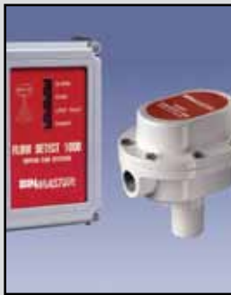
Flow Detect 1000 Microwave Flow Detection

Preferred Applications: Powders and solids Measuring Range: 200 feet (61 meters) Supply Voltage: 20 - 32 VDC Process Temp: -40°F to 185°F (-40°C to 85°C) Process Pressure: -0.2 - 1bar (-2.9 to 14.5 psi) Signal Output: 4-wire 4-20mA/HART/RS-485/Modbus Emitting Frequency: 3 KHz to 10 KHz Housing: Aluminum die cast powder coated Approval: ATEX II 1/2D, 2D, Ex ibD/iaD 20/21 T110°C, ATEX II 2G Ex ia/ib IIB T4, FM Intrinsically Safe Class I, II, Division I, Groups C, D, E, F, G