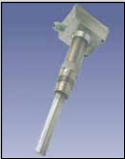
SHT-120/140 Vibrating Rod

Power Requirements: Wide range 20-250V AC/DC Power Consumption: 3 VA Relay: SPDT 5A 250 VAC Time Delay: 1 second from stop of vibration, 2 to 5 seconds for start of vibration Ambient Temp: -4°F to +150°F (-40°C to +65°C) Process Temp: To 176°F standard (80°C); to 300°F high temp (150°C) Pressure: 145 psi Wiring Cable: 1/2" Mounting: 1" NPT Enclosure: Die cast aluminum, NEMA 4, 5 & 12 Probe: 304 stainless steel, 6" insertion length Material Density: From 3.5 lb./cu. ft.