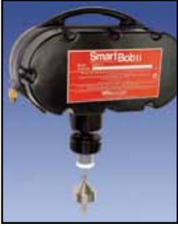
SmartBob2 Cable-Based Sensor