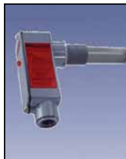
Compact PRO Capacitance Probe

Power Requirements: 115/230 VAC, 50/60 Hz \pm 15\% , 5 VA Output Relay: DPDT 10 Amp at 250 VAC Ambient Temp: -40^{\circ}\text{F} to +185^{\circ}\text{F} ( -40^{\circ}\text{C} to +85^{\circ}\text{C} ) Process Temp: To 250^{\circ}\text{F} Delrin/bare probe ( 121^{\circ}\text{C} ); to 500^{\circ}\text{F} Teflon probe ( 260^{\circ}\text{C} ) Pressure: 500 PSI Approvals & Certifications: Listed for Class II, Groups E, F & G Hazardous Locations Enclosure Type: NEMA 4X, 5, 9 & 12 Housing Enclosure: Die cast aluminum, USDA approved powder coat finish Mounting: 1-1/4" NPT or 3/4" NPT 316 stainless steel standard; 1-1/4" NPT 316 stainless steel & sanitary flange optional