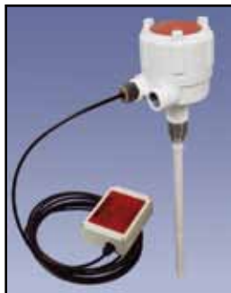
PRO REMOTE Capacitance Probe