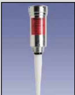
SmartWave Pulse Radar Transmitter

Power Requirements: AC units 115 VAC 60 Hz or 230 VAC 50 Hz; DC units 12 to 30 VDC 0.07 Amps Ambient Temp: -40°F to +140°F (-40°C to +60°C) Process Temp: Up to 200°F (93°C) Operation: Ultrasonic Frequency: 25 to 148 KHz Measurement Range Liquids: 90' maximum Measurement Range Solids: 40' maximum Accuracy: ± 0.25% Beam Angle: 6° - 12° conical at -3dB Temp Compensation: Continuous in transducer Output: 4-20 mA and RS-485 Mounting: 3" NPT Enclosure: PVC-94VO Approvals & Certifications: NEMA 4X (IP65)