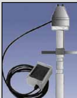
PRO HTRC-20 Capacitance Probe

Power Requirements: 115, 230 VAC or 24 VDC Output Relay: SPDT 5 amp at 250 VAC Ambient Temp: -40^{\circ}\text{F} to +185^{\circ}\text{F} ( -40^{\circ}\text{C} to +85^{\circ}\text{C} ) Process Temp: To 240^{\circ}\text{F} ( 116^{\circ}\text{C} ) Pressure: 150 PSI Approvals & Certifications: NEMA 4X, 5 & 12 Enclosure: PVC Probe: CPVC Mounting: 1" NPS (1-1/4" adapter available) LED: Indicates material presence or absence