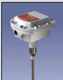
PRO AUTO CAL Capacitance Probe

Power Requirements: 115/230 VAC, 50/60 Hz \pm 15\% , 5 VA Output Relay: DPDT 10 Amp at 250 VAC Ambient Temp: -40^{\circ}\text{F} to +185^{\circ}\text{F} ( -40^{\circ}\text{C} to +85^{\circ}\text{C} ) Process Temp: To 250^{\circ}\text{F} Delrin probe ( 121^{\circ}\text{C} ); to 500^{\circ}\text{F} Teflon probe ( 260^{\circ}\text{C} ) Pressure: 500 PSI Approvals & Certifications: CSA Listed, Intrinsically Safe Class I, NEMA 4X, 5 & 12 Probe Enclosure: Die cast aluminum, USDA approved powder coat finish Electronic Enclosure: Polycarbonate or aluminum Mounting: 1-1/4" NPT or 3/4" NPT 316 stainless steel Standard: 1-1/4" NPT 316 stainless steel & sanitary flange optional