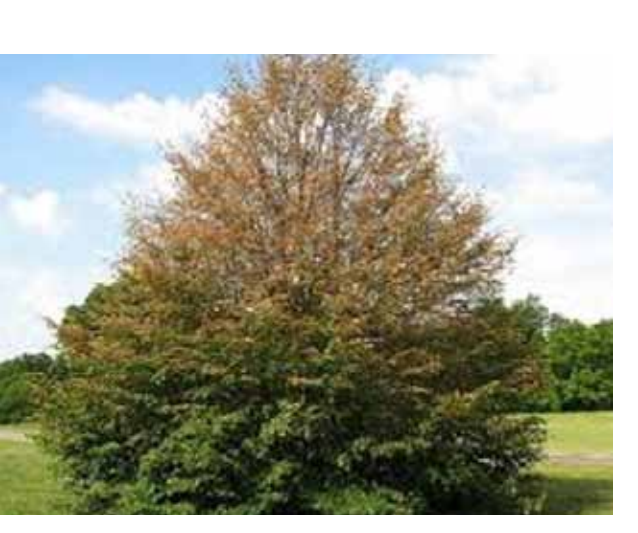
Above: Feeding damage starts at the top and outermost foliage, working their way inward and downward. Above, right: Japanese beetle adults are large with metallic green heads and copper brown wing covers.