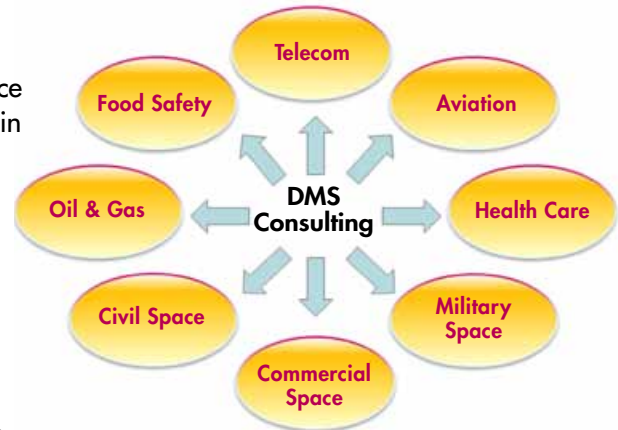
Initial Decision Management Solutions Market Focus

Smart organizations recognize the value of well thought out decisions aligned with their core values and good business and management practices. Smart organizations recognize the value of a decision management solution approach to solving their complex business challenges. Smart organizations choose Futron.