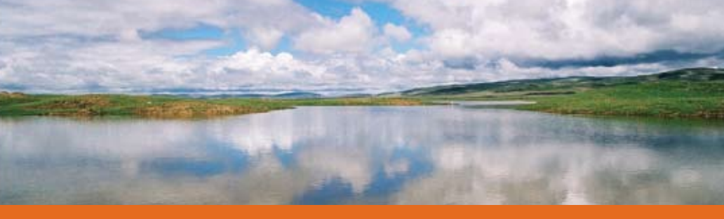
Gorgeous Tibetan landscape at midday, near the Jyekundo village