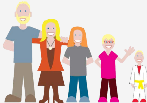
The Cahill Family

Never doubt that a small group of thoughtful, committed citizens can change the world; indeed, it's the only thing that ever has.