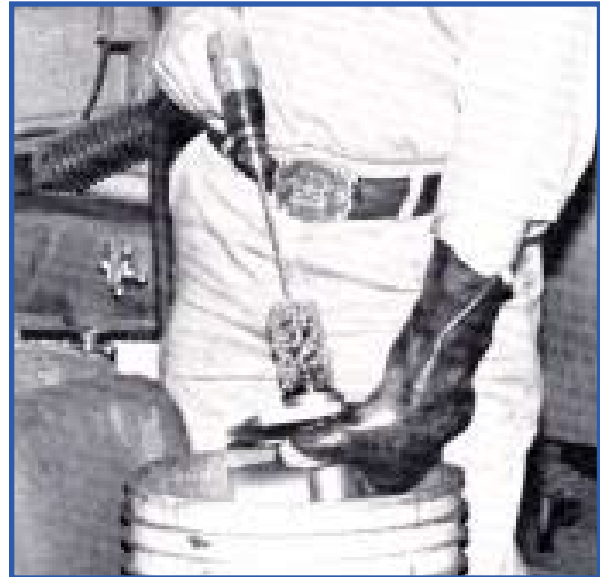
A smaller diameter Flex-Hone Tool is used in the finishing of master cylinders at RMP.