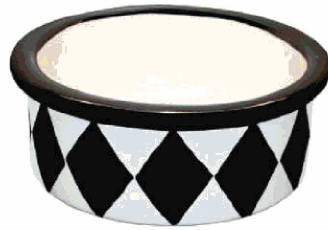
Melia Pet Harlequin, Fleur de Lis and Paw Pet Bowls 410-795-4444, www.petpalette.com, or Circle Reader Service Card #1224