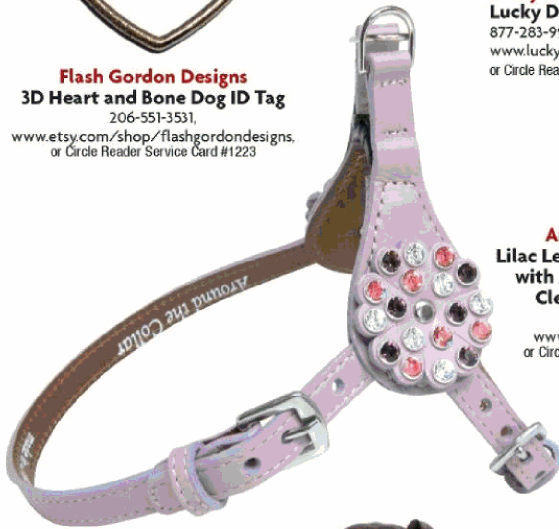
Around the Collar Lilac Leather Step-In Harness with Amethyst, Rose and Clear Crystal Stones 631-676-7320, www.aroundthecollar.com, or Circle Reader Service Card #1221