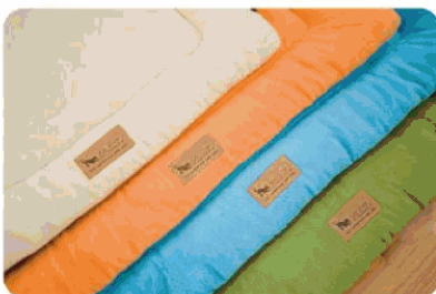
Dog in the Closet Nottingham and Boxer Shorts 940-538-5601, www.doginthecloset.com, or Circle Reader Service Card #1219

855-300-7529, www.PetPLAY.com, or Circle Reader Service Card #1220