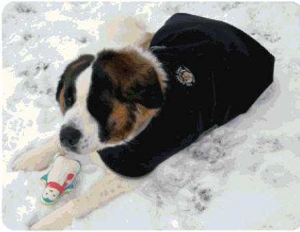
The Chase Coat for Big Dogs The Chase Coat 248-957-8573, www.chasecoat.com, or Circle Reader Service Card #1225