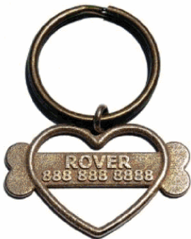
Flash Gordon Designs 3D Heart and Bone Dog ID Tag 206-551-3531, www.etsy.com/shop/flashgordondesigns, or Circle Reader Service Card #1223