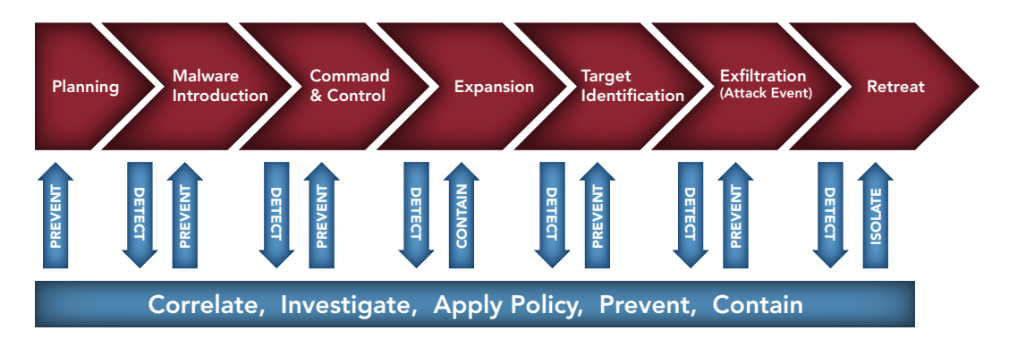
Figure 3: An Integrated Platform Offers Security Teams a Power Force Multiplier in the Fight Against Cyber Attack

There is a Catch 22 here — these defenses need to be autonomous, meaning that if one system becomes infected and compromised it will not degrade the ability of the other systems to operate effectively. At the same time the detection intelligence collected needs to be easily correlated so that attacks are quickly and accurately defined. Integration between products must exist but in a way that does not compromise the integrity of the Kill Chain strategy. SIEM tools offer value in the correlation process with no risk of system degradation but lack the policy controls to execute the next stage of the Kill Chain strategy, while integrated autonomous layers of defense offered by advanced cyber defense products can be even more effective.