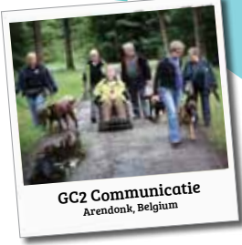
GC2 Communicatie Arendonk, Belgium