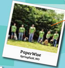
PaperWise Springfield, MO