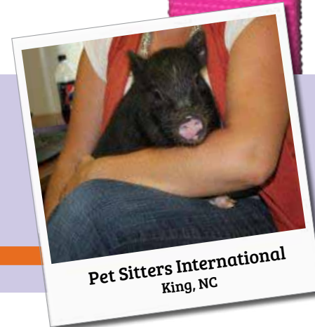
Pet Sitters International King, NC

Download your free copy of the 2013 TYDTWDay Action Pack