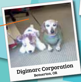
Digimarc Corporation Beaverton, OR