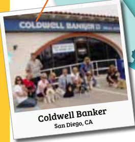
Coldwell Banker San Diego, CA