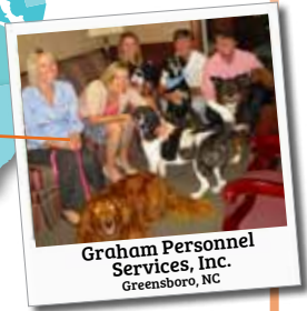
Graham Personnel Services, Inc. Greensboro, NC