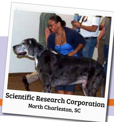
Scientific Research Corporation North Charleston, SC