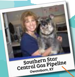
Southern Star Central Gas Pipeline Owensboro, KY