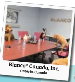
Blanco® Canada, Inc. Ontario, Canada