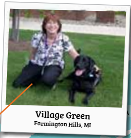
Village Green Farmington Hills, MI