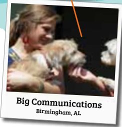
Big Communications Birmingham, AL