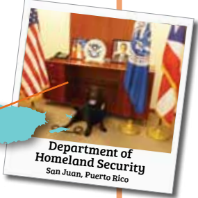
Department of Homeland Security San Juan, Puerto Rico