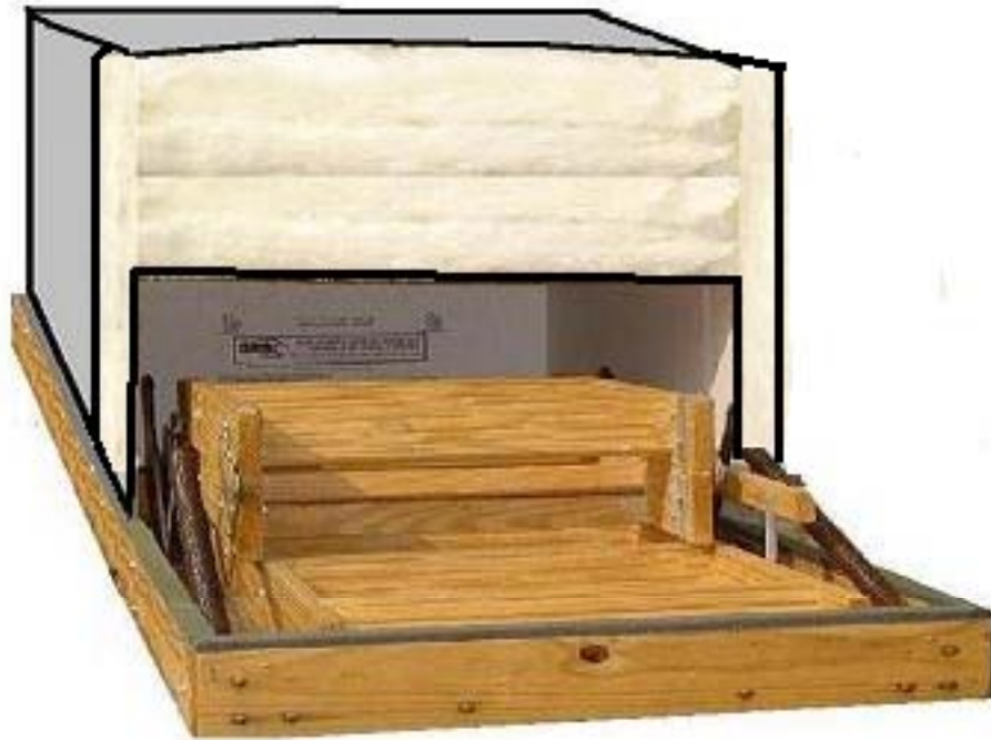
Battic Door Attic Stair Cover