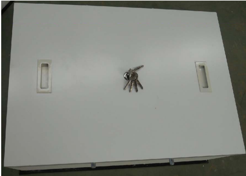
Deluxe E-Z Hatch